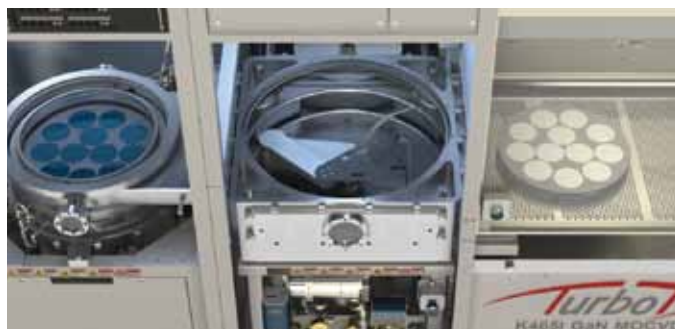
Fully automated, production-proven platform

Veeco Instruments Inc. MOCVD Systems 394 Elizabeth Avenue Somerset, NJ 08873 Tel 732.560.5300 Fax 732.560.5301